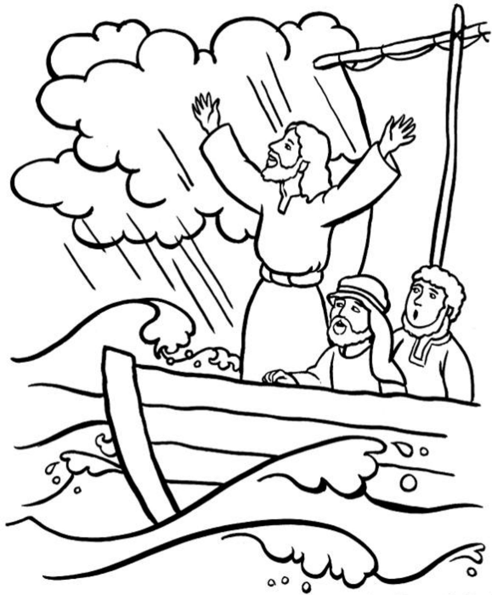
Jesus did amazing things because he is the Son of God.